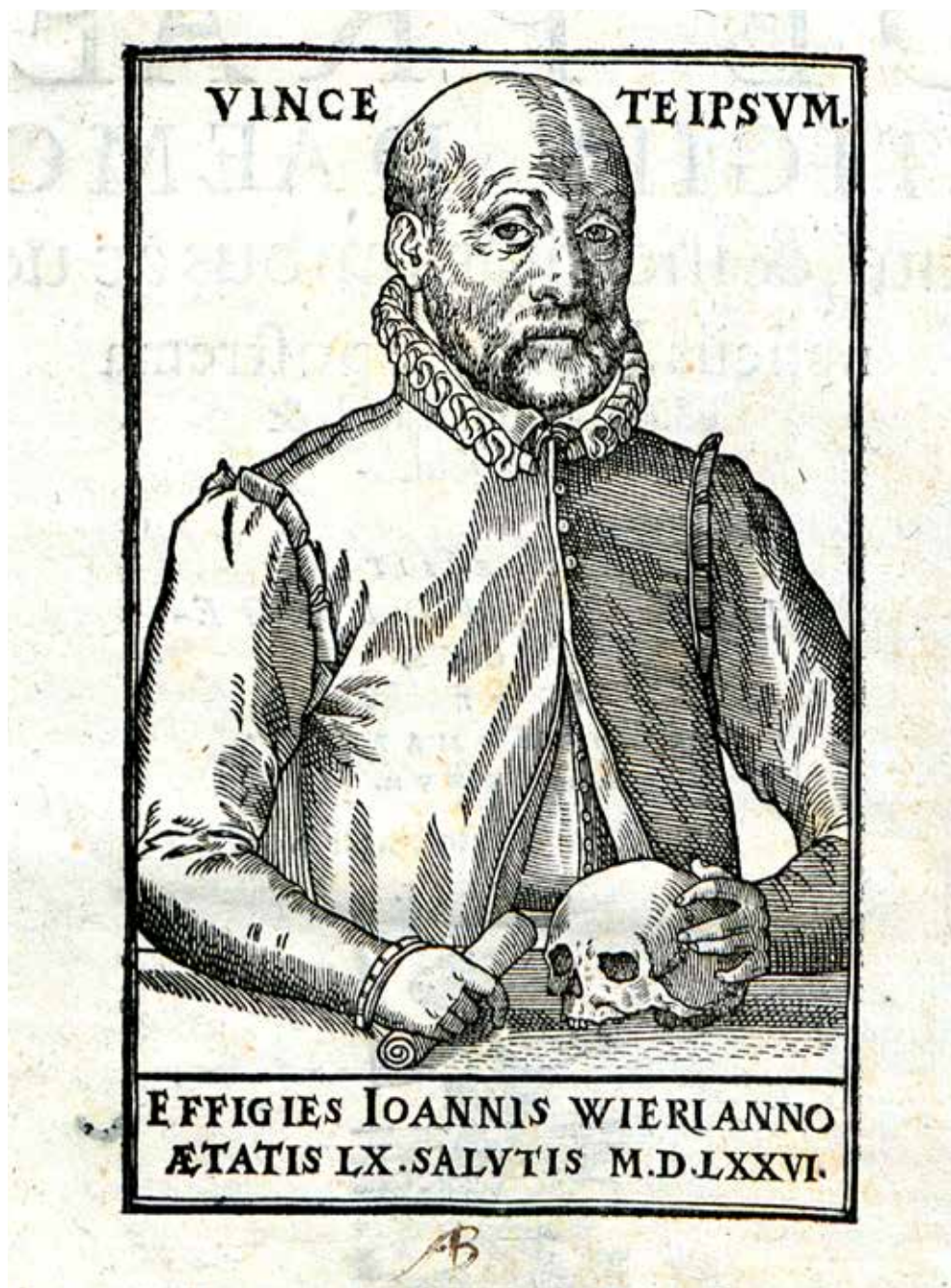
▲ Portrait of Johann Weyer in the 1577 edition of De praestigijs daemonum .

Maurits Sabbe Library, Faculty of Theology and Religious Studies, KU Leuven.