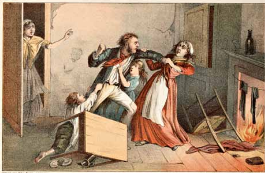
Tijdschrift van 1848, Eerste, Amsterdam.

Hetwelk door zijne schuld van kommer eens moest steven, Doet iets wat strijdig is met godsverricht en verstand.