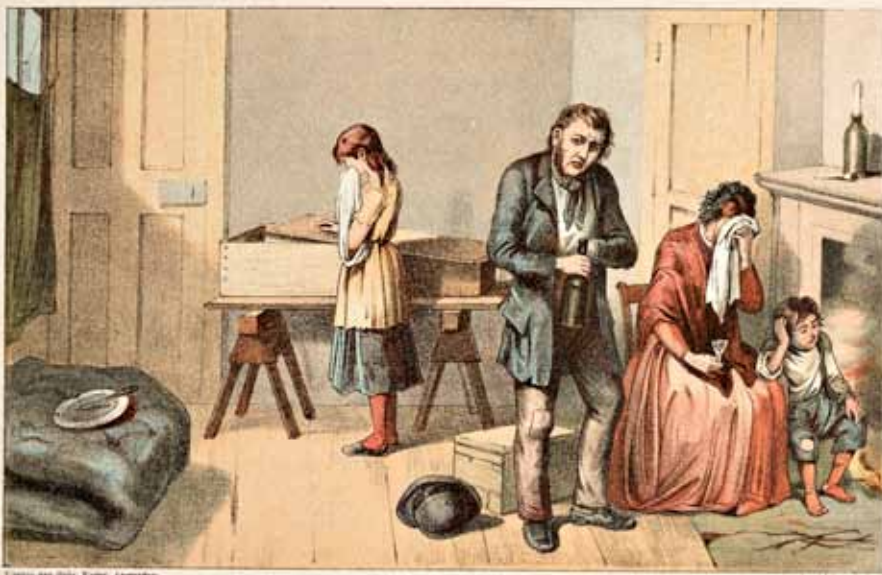
Tijdschrift van 1848, Eerste, Amsterdam.